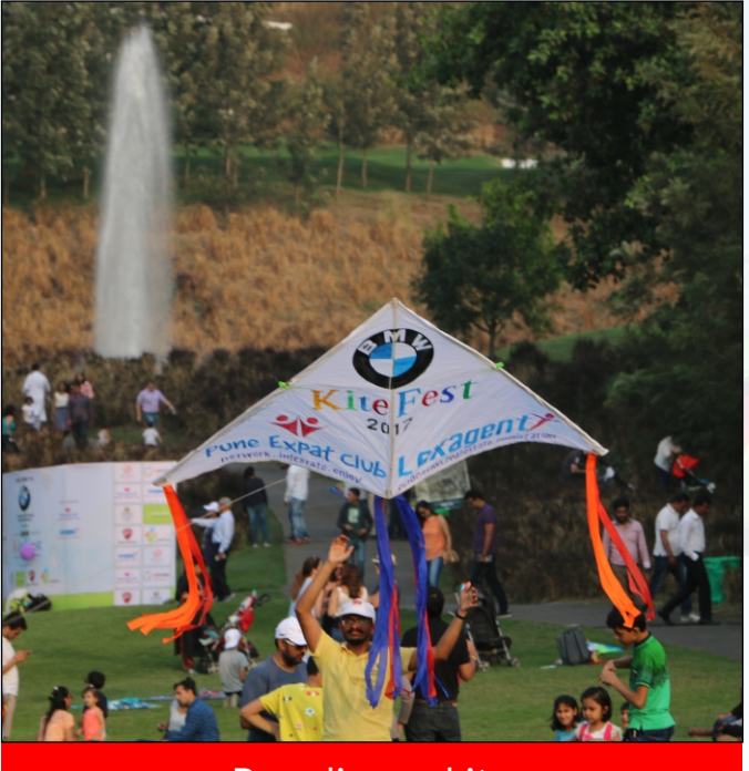
Branding on kite