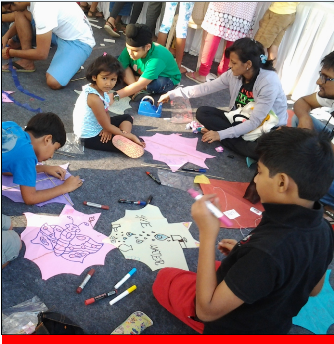
Kite Making workshop