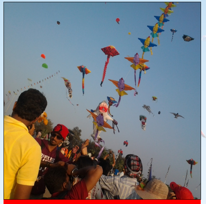
Kite Flying show

Kite Hying show ELD Hight Hying Kite Branding on kite Kite Making workshop